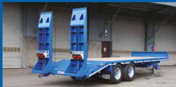
GX 10 LL