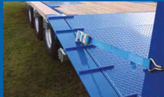
OUTRIGGERS BEAVER TAIL