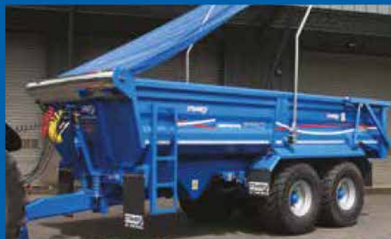
HYDRAULIC FLIP COVER