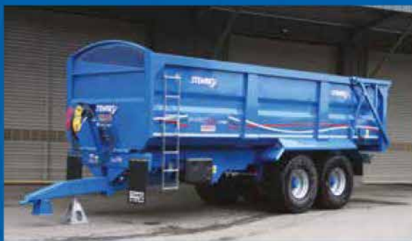
PRO Series PS 19 25 H