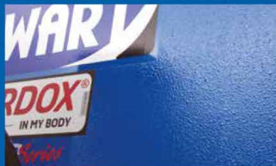
STONE CHIP PROTECTION PAINT