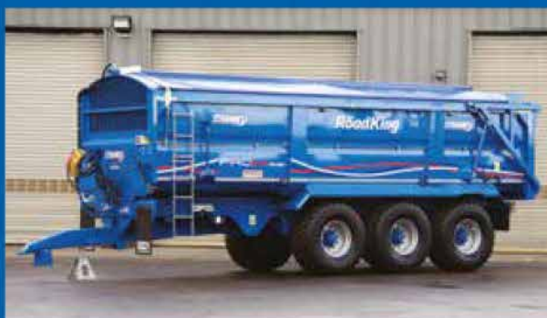
PRO Series RoadKing XV 20 26 H