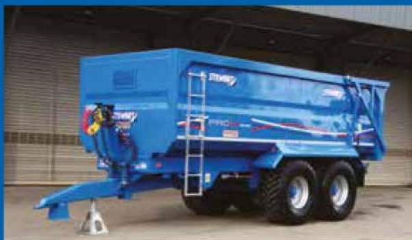
PRO Series PS 16 21 HS