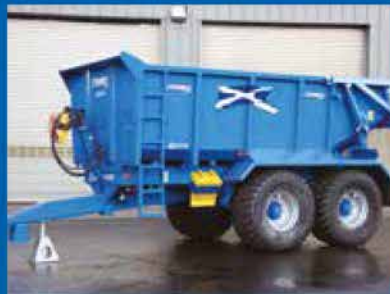
GX 15 CD