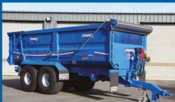
PRO Series PS 18 23 H