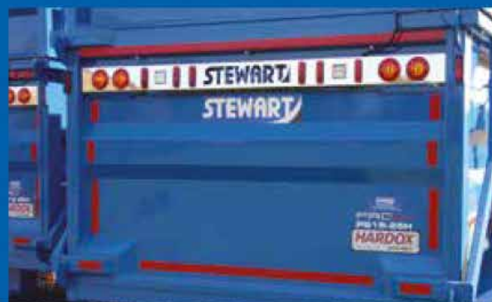
STAINLESS STEEL LIGHT BAR