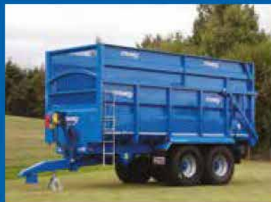
GX 16 21 S