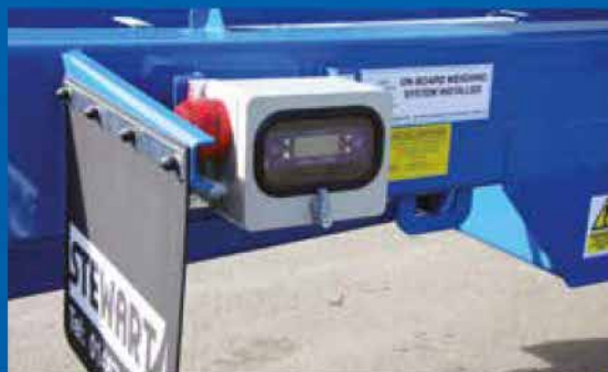
WEIGH SYSTEM DISPLAY