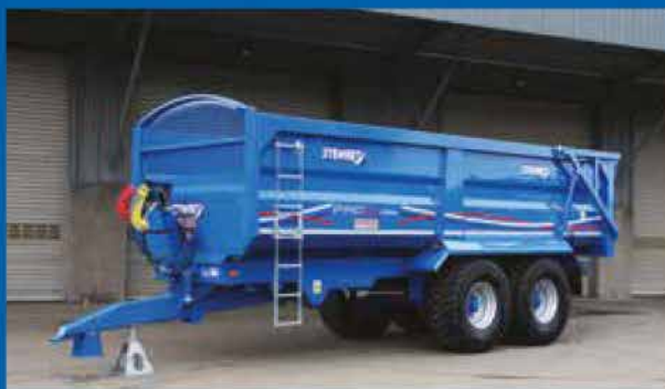
PRO Series PS 16 21 HL