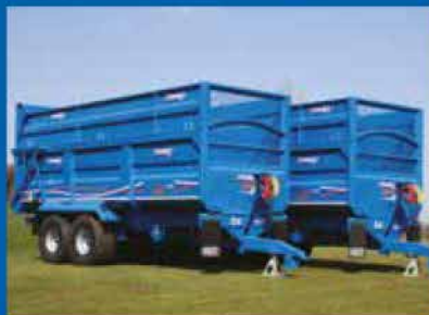
PRO Series PS 19 25 H

Hardox® is a wear plate; structures made of Hardox® weigh less and last longer than those made from mild steel. A tipper body made from Hardox® is more durable due to the unique combination of hardness and toughness. Using Hardox® allows for a body design with a minimum number of reinforcing beams on the outside.