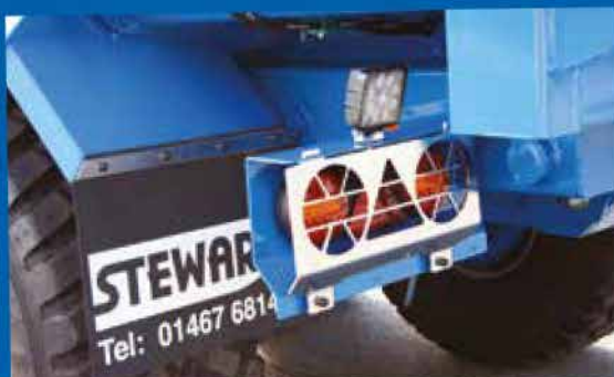
REAR WORK LIGHT