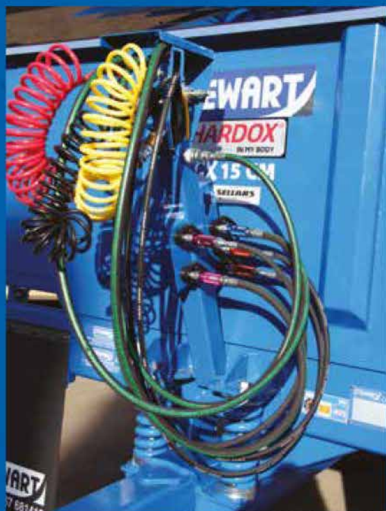
COLOUR CODED HYDRAULIC HOSE GRIPS