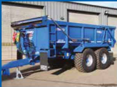
GX 15 CM

Hardox® is a wear plate; structures made of Hardox® weigh less and last longer than those made from mild steel. A tipper body made from Hardox® is more durable due to the unique combination of hardness and toughness. Using Hardox® allows for a body design with a minimum number of reinforcing beams on the outside.