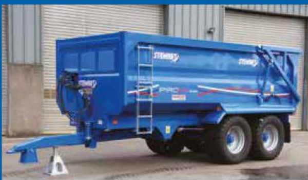
PRO Series PS 12 16 H