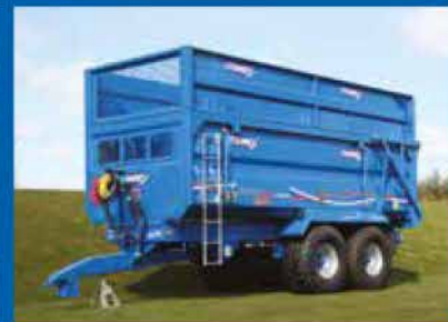
PRO Series PS 16 21 HS