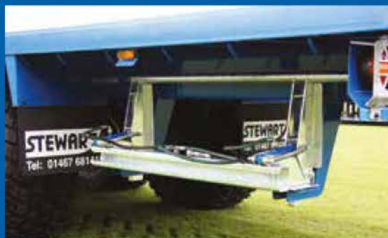
BOX PUSHER STORAGE