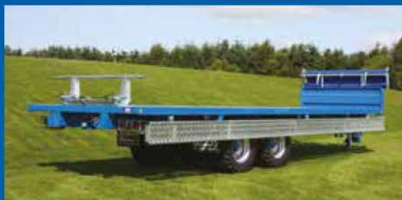
GX 15 FT