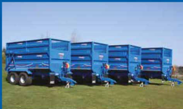
PRO Series PS 14 19 HS