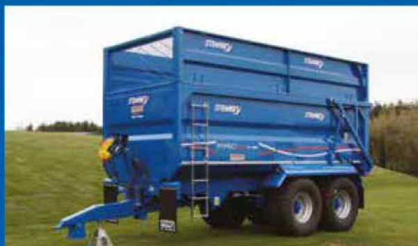
PRO Series PS 14 19 HS