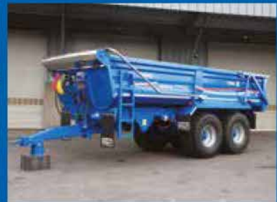
CONSTRUCTION PRO CP 20 H