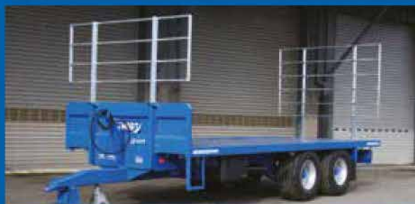
GX 10 FT

OUR FLAT TRAILERS CAN BE SUPPLIED WITH A 4MM STEEL FLOOR OR A 28MM KERUING FLOOR FOR THE SAME PRICE. THE STANDARD FLAT TRAILER IS USED WITH OUR LIVESTOCK FLOATS, FOR CARRYING A FLOAT WE RECOMMEND A KERUING FLOOR AND 435/50RX19.5 TYRES.