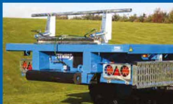
BOX PUSHER & PUSH BAR