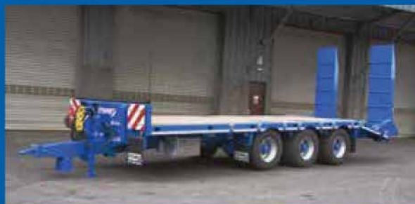
GX 22 LL

OUR LOW LOADER TRAILERS ARE FITTED WITH A 45MM KERUING FLOOR. HYDRAULICALLY OPERATED RAMPS ARE STANDARD ON 15 TONNE AND 22 TONNE MODELS. EVERY TRAILER IS CUSTOM BUILT, THERE ARE A WIDE VARIETY OF OPTIONAL EXTRA ITEMS AVAILABLE TO CHOOSE FROM. WE CAN SUPPLY OPEN TREAD RAMPS, TIMBER CLAD RAMPS OR STEEL RAMPS, THE STEEL RAMPS CAN BE GALVANISED OR PAINT FINISHED.